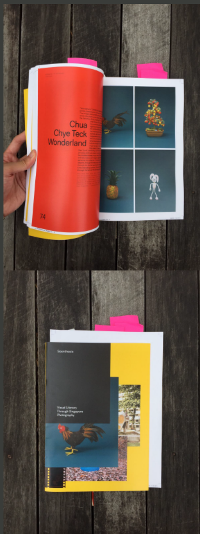
Photos of colorproof sample

Pre-purchase your copy at tinyurl.com/Seenthesis before the 20th of July for a cheaper than retail price